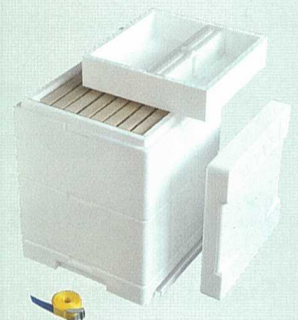
APIDEA Nucleus Hive, CH-measurement