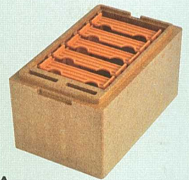
APIDEA Brood Chamber Super