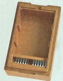
APIDEA Feeder Super